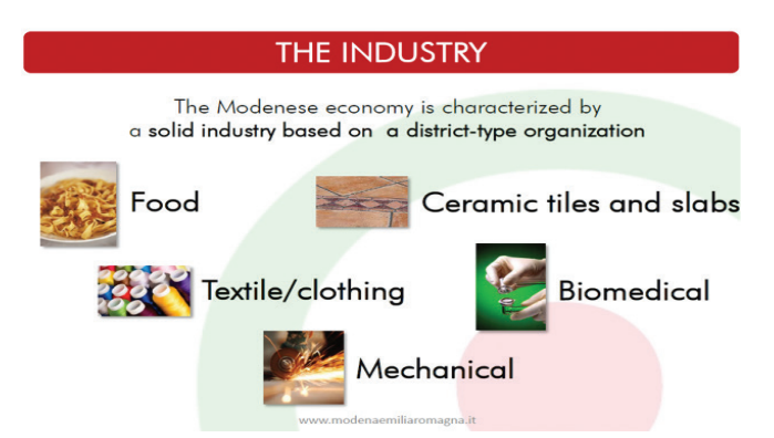
Fig. 5 - The range of local enterprises

Fig. 4 - The Agency's geographical location